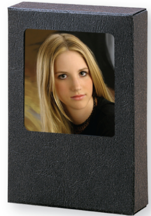
B. WILLOW WALLET BOX