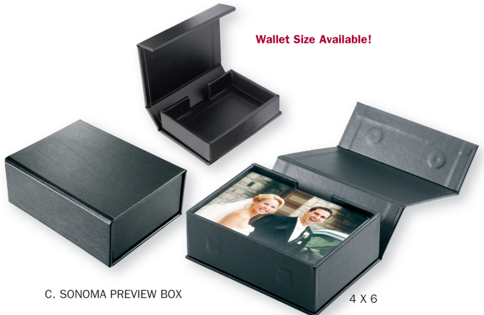
C. SONOMA PREVIEW BOX