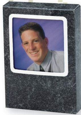
A. MARBLE WALLET BOX