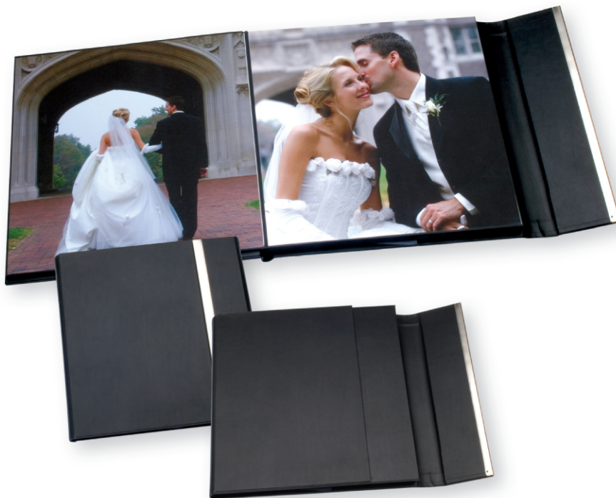
A. SUPERIOR MOUNT MAGNET ALBUM