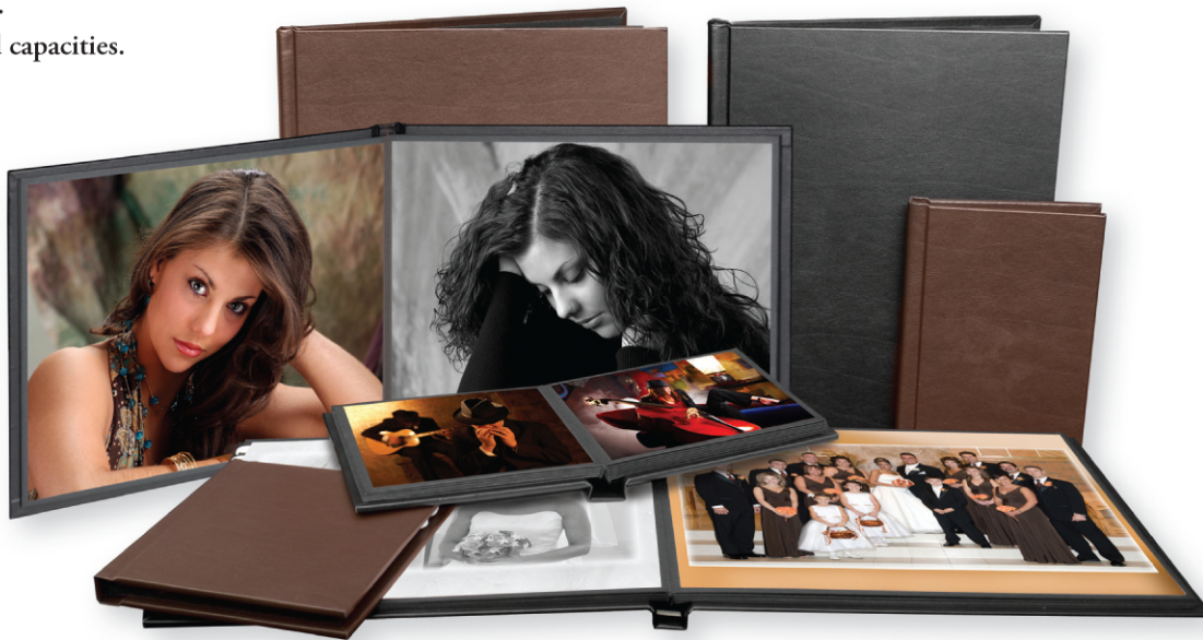
B. SUPERIOR MOUNT ALBUM