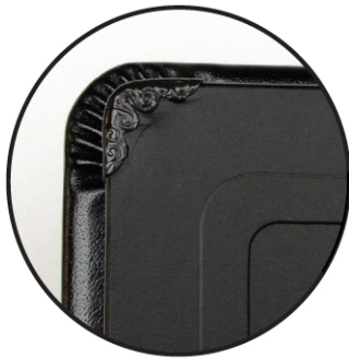
Durable insert corners for added protection.